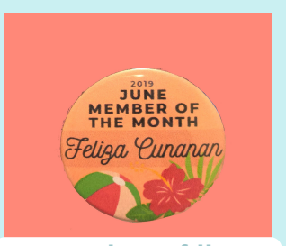
member of the month